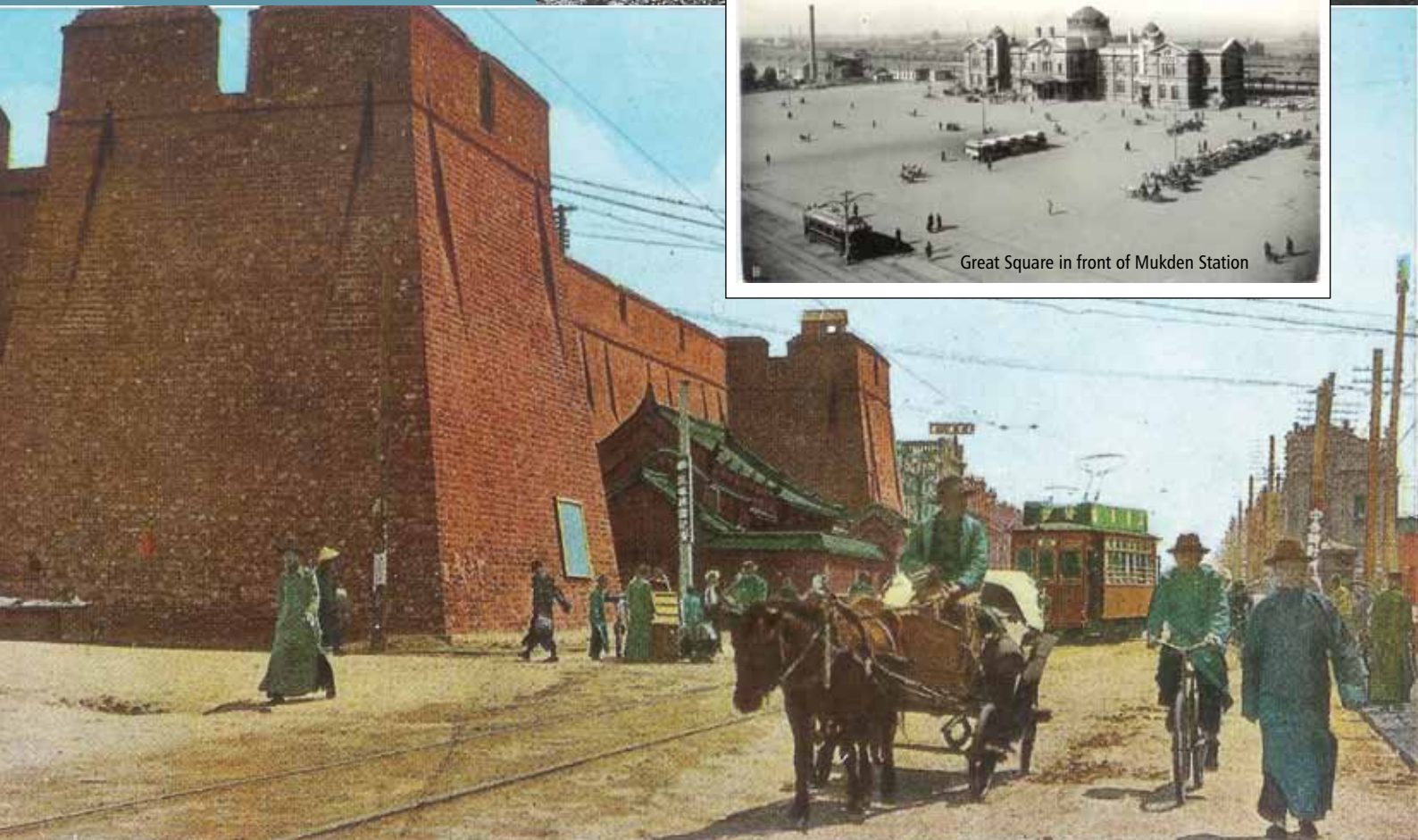
WALL OF MUKDEN 壁城天奉

てめ古な城區一の街市でつ保に壁城を影画の昔も内城天奉。たつあてれま園で壁城な丈頭でべすは會都の洲滿の來在 さ高の壁城、中里一圓周、れまこかで壁城の形方は城内のそ。るみてつならか城二の外内しな形円体大は内城。るも 。だのもるた々堂に宣は壁城にけだたつあで都首の朝濟。るみてし有な門八小大る田へ城外、尺十三