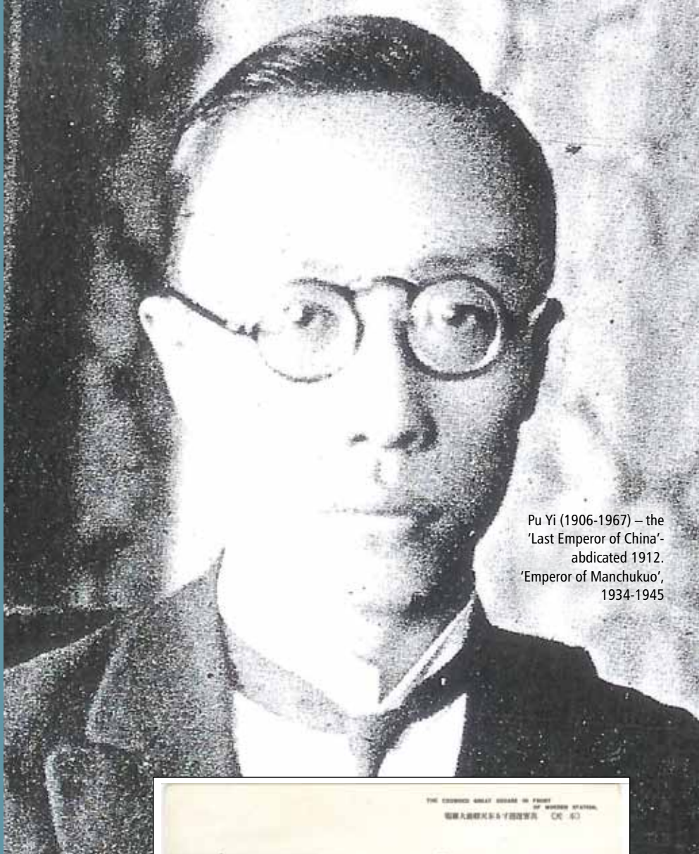
Pu Yi (1906-1967) – the 'Last Emperor of China' – abdicated 1912. 'Emperor of Manchukuo', 1934-1945