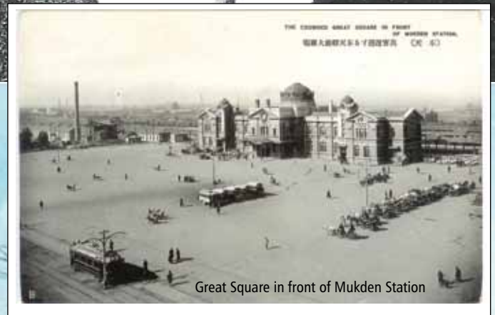
Great Square in front of Mukden Station